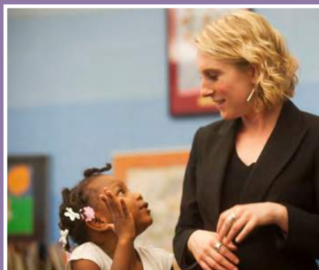
Iowa Youth Writing Project