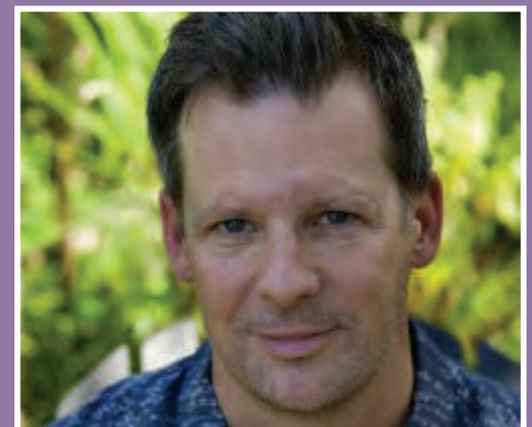
Iowa Young Writers' Studio